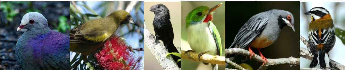
Grey-fronted Quail Dove

Bare-legged Owl, Cuban Oriole, Bee Hummingbird, Blue-headed Quail-Dove, Gray-fronted Quail-Dove, Cuban Black Hawk, Cuban Blackbird, Cuban Bullfinch, Cuban Gnatcatcher, Cuban Grassquit, Cuban Green Woodpecker, Cuban Parakeet, Cuban Parrot, Cuban Pewee, Cuban Pygmy-Owl, Cuban Solitaire, Cuban Tody, Cuban Trogon, Cuban Vireo, Fernandina's Flicker, Giant Kingbird, Gundlach's Hawk, Eastern Meadowlark, Cuban Nightjar, Red-shouldered Blackbird, Tawny-shouldered Blackbird, Oriente Warbler, Yellow-headed Warbler, Zapata Wren, Zapata Sparrow, Cuban Crow, Palm Crow, Cuban Emerald, Bahama Mockingbird, Thick-billed Vireo, & Western Spindalis.