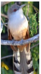
Great Lizard Cuckoo

Breakfast followed by a walk along forest paths to the nearby community Cuban Grassquit and Olive-capped Warbler are important target species. Along the way our local naturalist will point out birds and other fauna we encounter as we explore native pine forest and submontane seasonal rain forest habitat. Lunch is at Cafetal Buena Vista , offering sweeping views of the mountains, plains and coast. Departure east to the Zapata Peninsula (4 hours). Birding stops along the way as opportunity permits. Accommodation / dinner in private home stays in Playa Larga (3 nights) on the picturesque Bay of Pigs . This region contains the largest wetland complex in the West Indies, and is Cuba's most prolific birding region. Here we have access to excellent local guides, as well as to protected areas and birding locations off the beaten track.