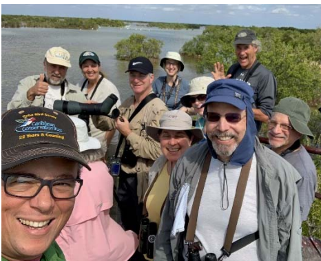
Caribbean Conservation Trust www.cubirds.com

We suggest flying from south Florida to Havana with JetBlue, Southwest, or American Airlines. We aim for the earliest departures in each direction. We will provide all of the information necessary to make booking these flights simple & secure. Flight costs range from $ 275.00 - $ 350.00 round trip.