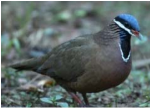
Blue-headed Quail Dove