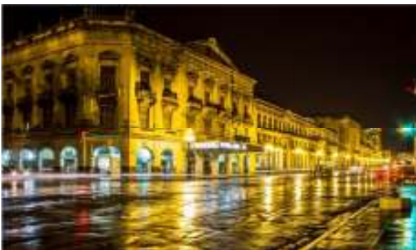
Habana Vieja (Old Havana), Cuba

Breakfast and morning transfer to Jose Marti International Airport for your return flight to Florida