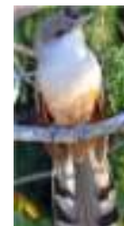
Great Lizard Cuckoo

Early breakfast and departure for birding within Zapata National Park and a morning walk along a dry roadway in the swamp at La Turba . This is our best opportunity for Zapata Wren , Zapata Sparrow , Red-shouldered Blackbird and Tawny-shouldered Blackbird and a variety of warblers and other migrants. Lunch and a trip to Las Salinas Wildlife Refuge , with numerous shorebirds, Reddish Egrets, Wood Storks, Spoonbills, Flamingos and endemic Cuban Black-Hawk . All walking is on dry, flat terrain (less than 2 miles total). Dinner at a private restaurant in the village, accommodation in Playa Larga.