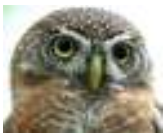
Cuban Pygmy Owl

We work with a very competent team of biologists, museum curators and naturalists in Cuba. Our full time Cuban biologist and primary Cuban birding guide will be with us throughout the program in the field and will assist in finding and identifying birds, as well as providing a broad overview of Cuban natural history. He may share specific information relative to the flora, fauna, geology and other natural features of the environments we visit. Additionally, we will work with regional naturalists from the national parks and biosphere reserves that we visit around the country.