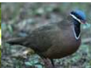
Blue-headed Quail Dove